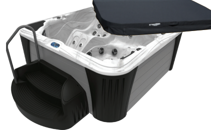
Suite Steps and Handrail with Storage Wide steps with sturdy handrail and side compartments for storage, or planter.

and Cover Lifter Weather and fade resistant lockable energy saving cover with locking safety straps. Plus, convenient cover lifter for opening, replacing and handling your cover.